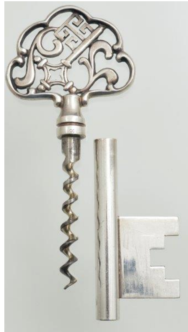
KY74 Corkscrew key of St. Peter with an unusual bit. $89 $39