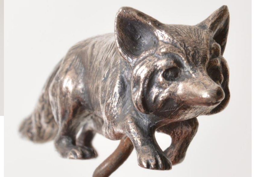
KFL114 Silver-plated fox corkscrew. $79