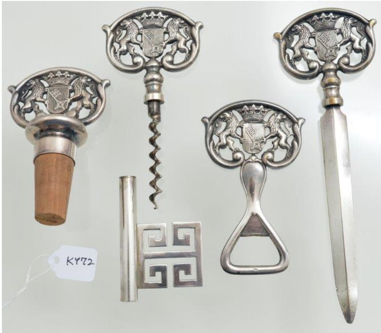
KY72 A bar set featuring the Bremen Coat of Arms. $125 $49