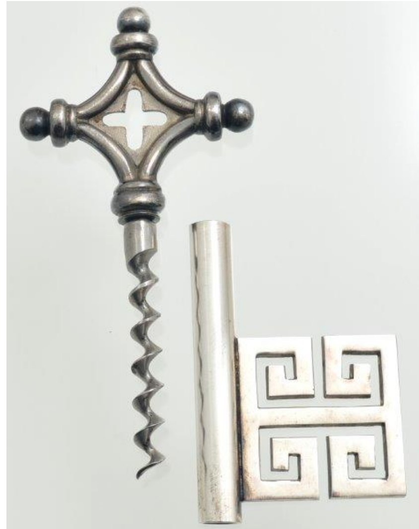
KY126 St. Peter corkscrew key. St. Peter is the patron saint of Bremen. $69 $33