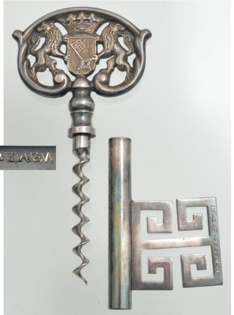
KY87 A Bremen key in a presentation box from ESSO celebrating the World Marine Operating Conference, Bremen, Germany, in 1958. $139 $65