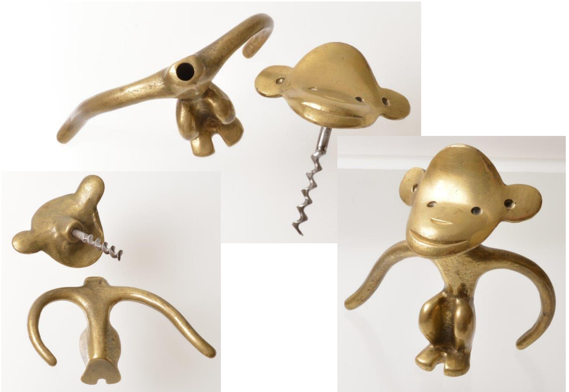
KFL098 Large monkey. Baller Austria. $135