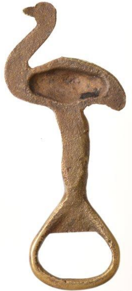
KFL128 Swan opener. $16