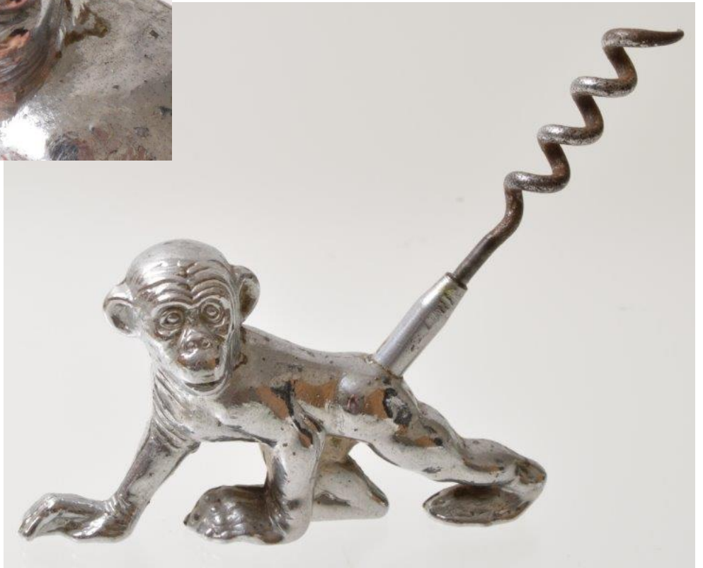
KFL102 A running monkey with corkscrew tail. $85