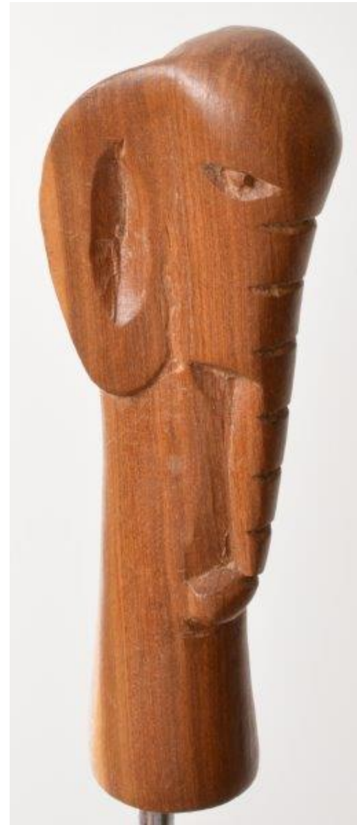
KFL096 Wooden elephant head. $19