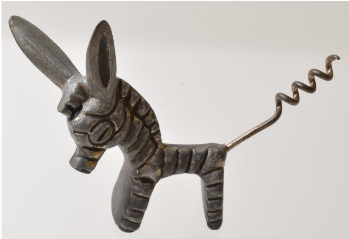
KFL109 A zebra corkscrew with “stripes” on one side and solid color on the other. $59