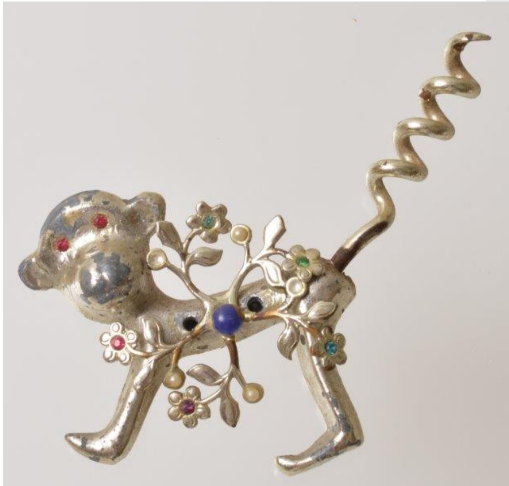
KFL106 Cheesy bejeweled monkey. $15