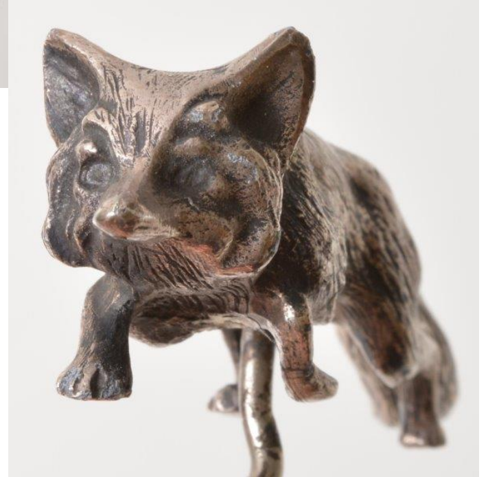
KFL036 Large Fox. 5". $95