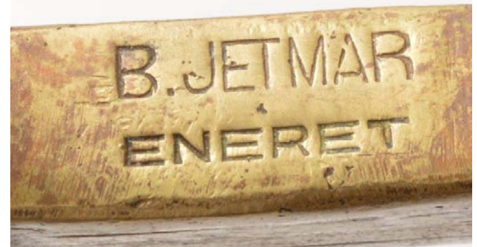
KFL119 Art Deco dog marked B. JETMAR for the maker Jetmar B & Son. Also marked ENERET for "Rights Reserved". C.1930s. $119