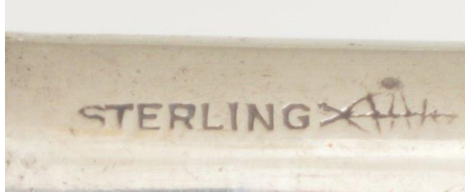
A190 Combination corkscrew and bottle opener marked STERLING with maker's mark. $55