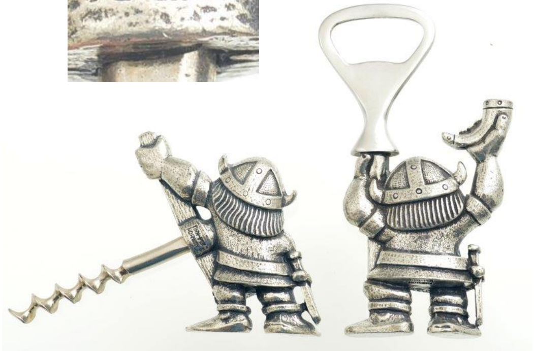
SP33 A Viking weighing anchor corkscrew and a Viking bottle opener. The corkscrew is marked TINN-PER NORWAY. $89 for the set