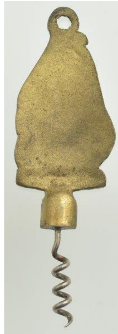
SP18 Two finger pull corkscrew. $6