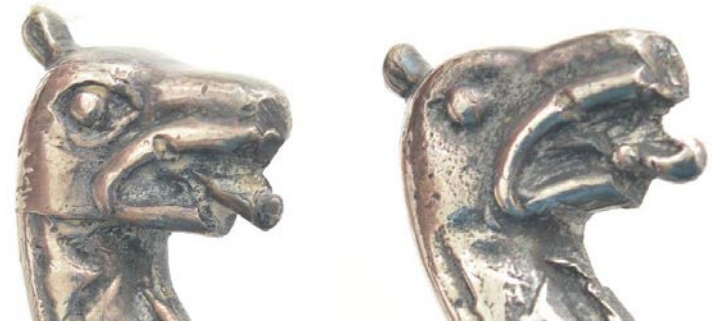
SP25 Silver-plated Viking ship with two heads. Missing the sail The ship makes a nice "T" pull. Marked O S P 40. $39