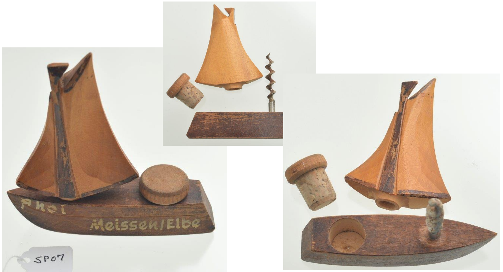
SP07 The sail of the wooden sailboat conceals a worm and a bottle stopper. $18