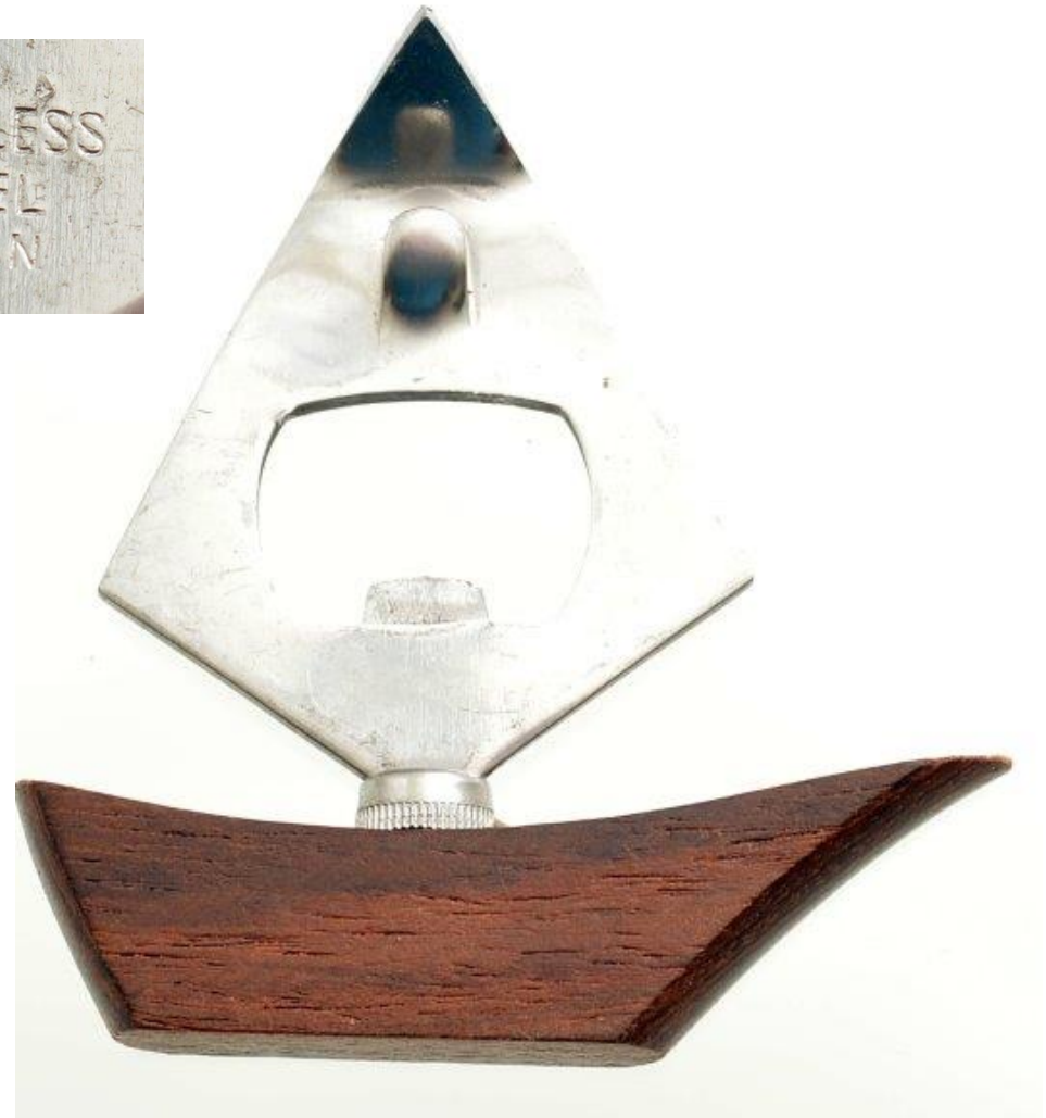
SP34 Combination bottle opener and can piercer wooden sailboat. Souvenir of Nassau (Bahamas). $7