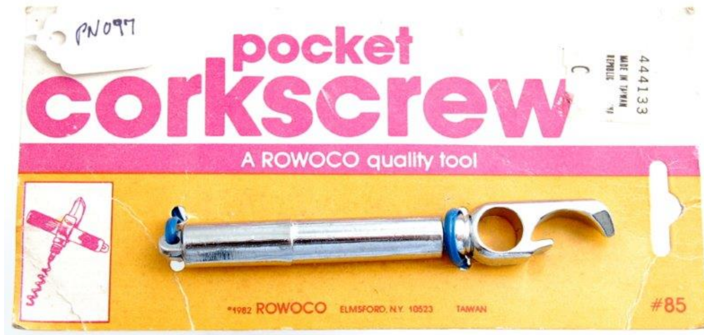
PN097 ROWOCO Corkscrew on original card. ©1982. $19