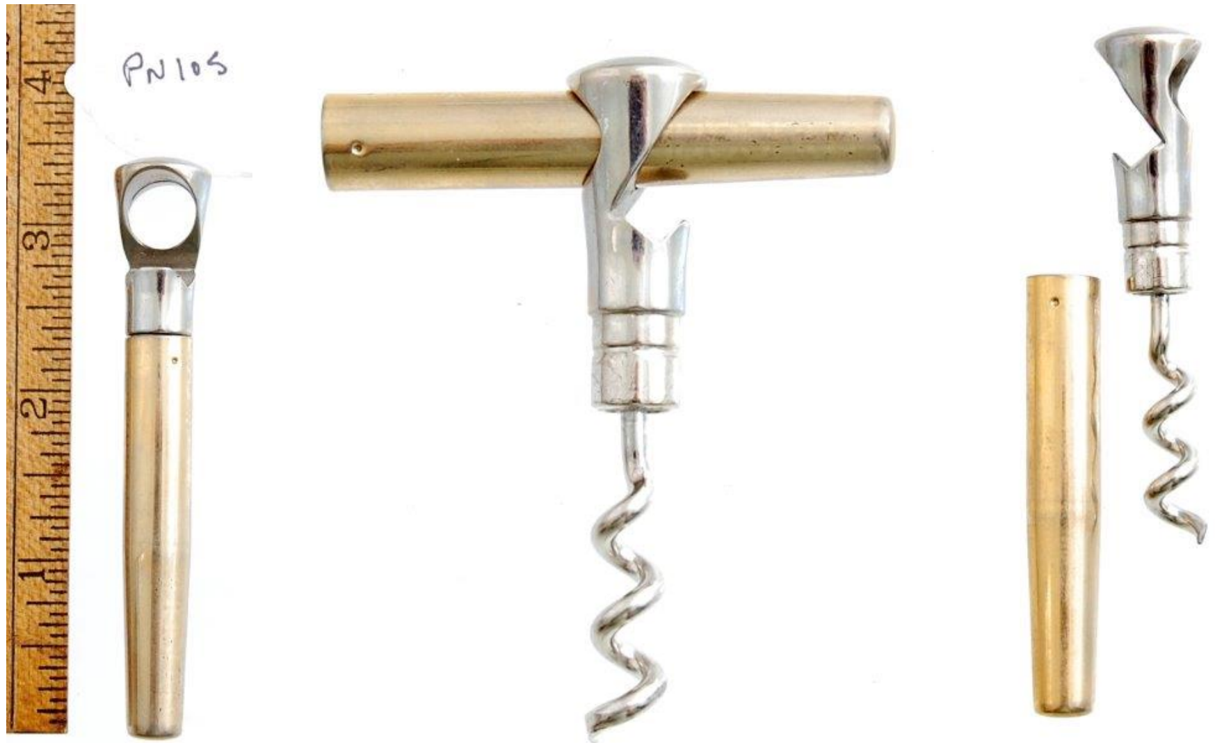
PN105 Elegant modern design corkscrew and cap lifter with a snap fit sheath. $25