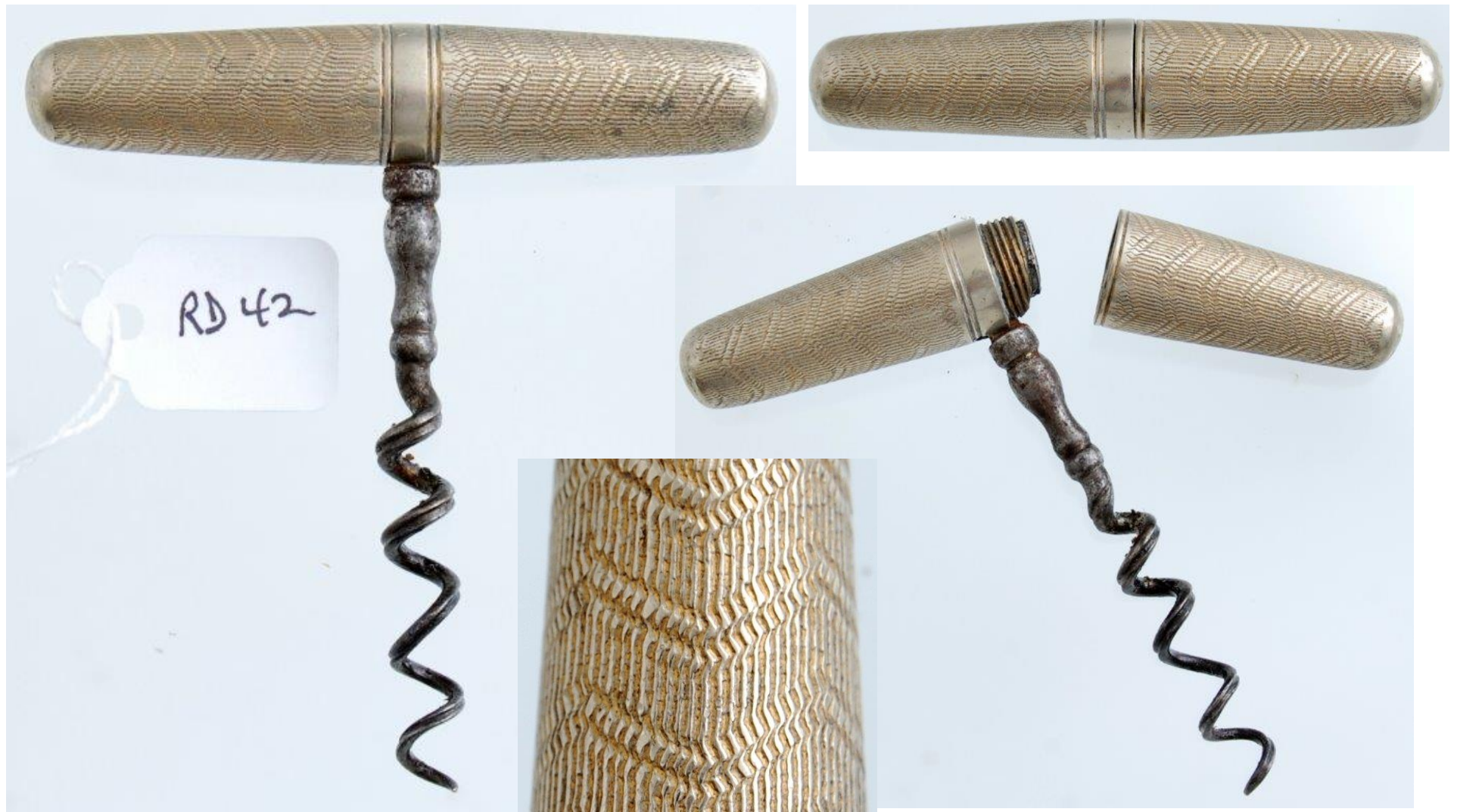
RD42 Machined pattern on nickel plate. Not marked. $75