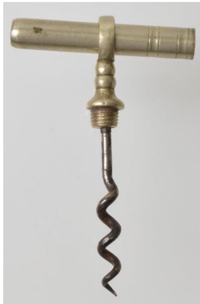
XX070 Picnic corkscrew. $12