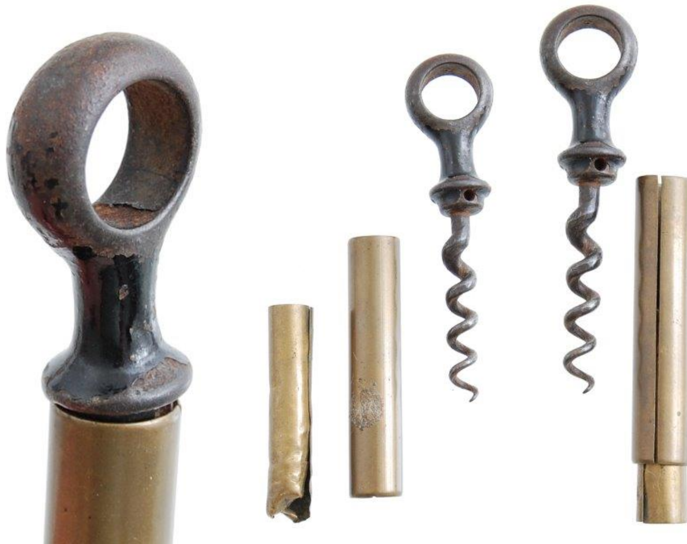
PN018 Corkscrew with double sheath ??? $8