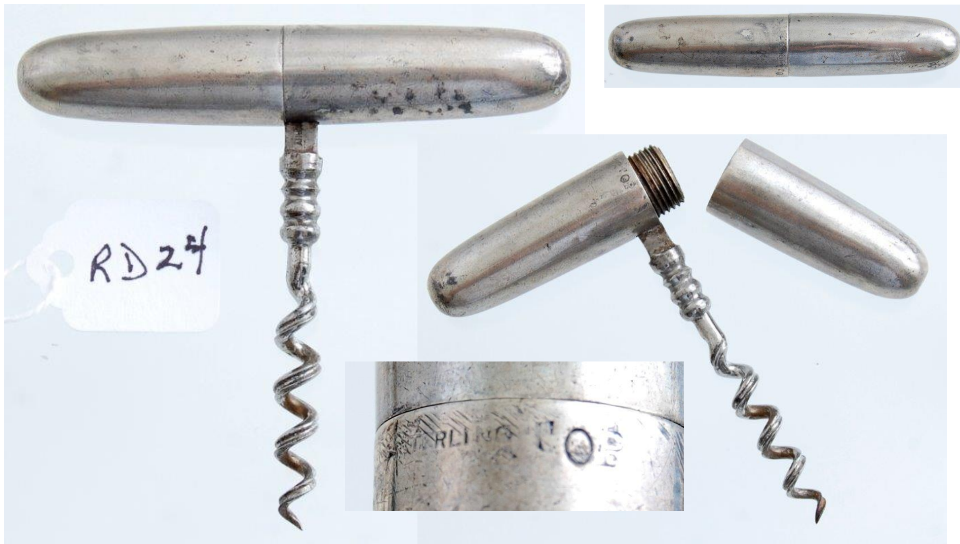
RD24 Simple design. Marked STERLING. $75