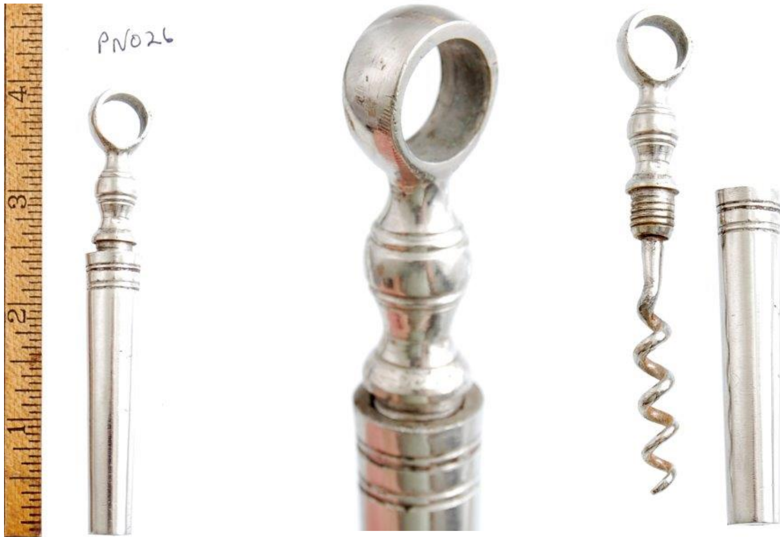
PN026 Thread a little rough in one spot. $29