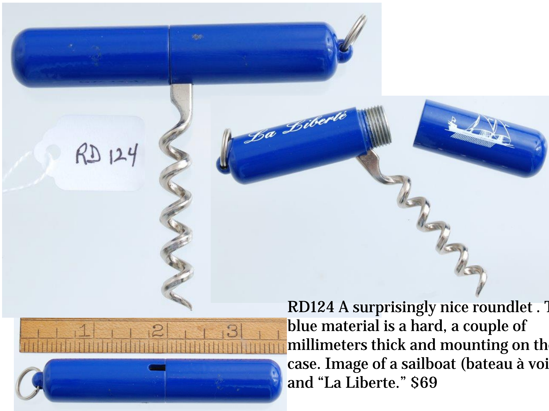
RD124 A surprisingly nice roundlet . The blue material is a hard, a couple of millimeters thick and mounting on the case. Image of a sailboat (bateau à voile) and “La Liberte.” $69