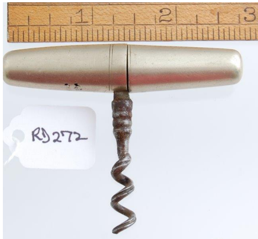
RD272 Roundlet Short Worm $1