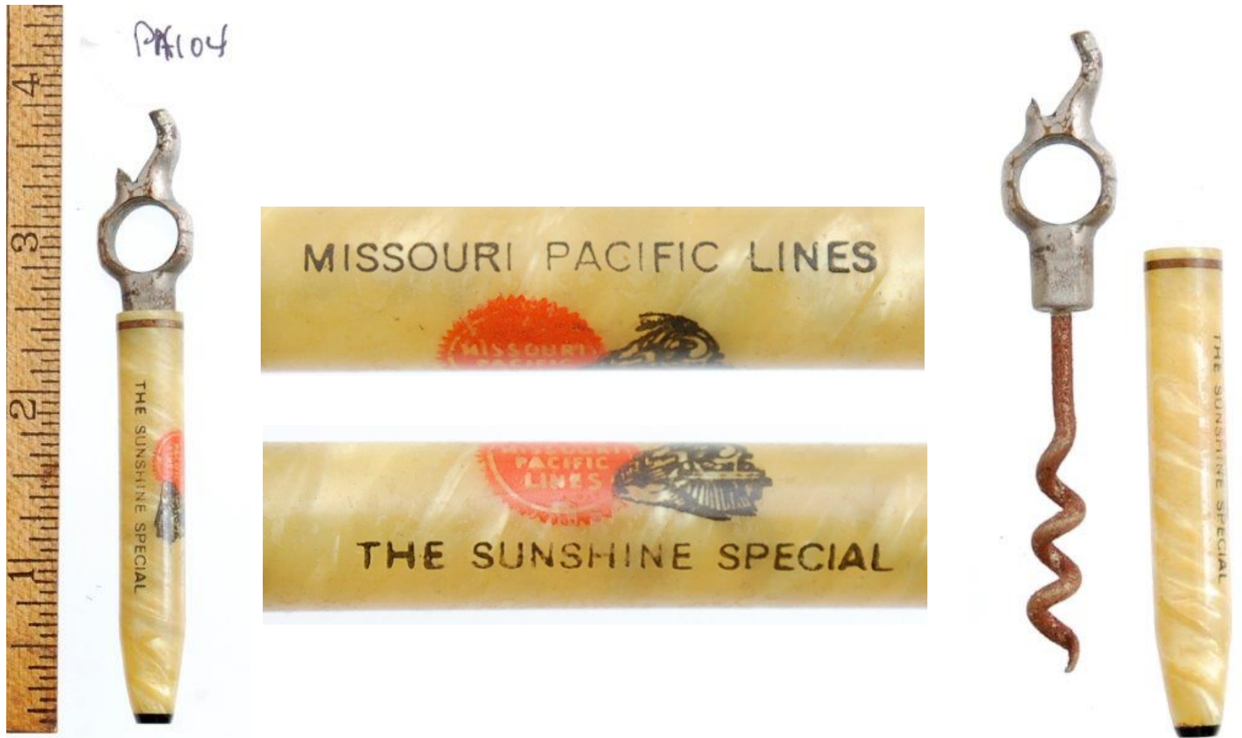
PN104 Picnic corkscrew / cap lifter advertising Missouri Pacific Lines. $15