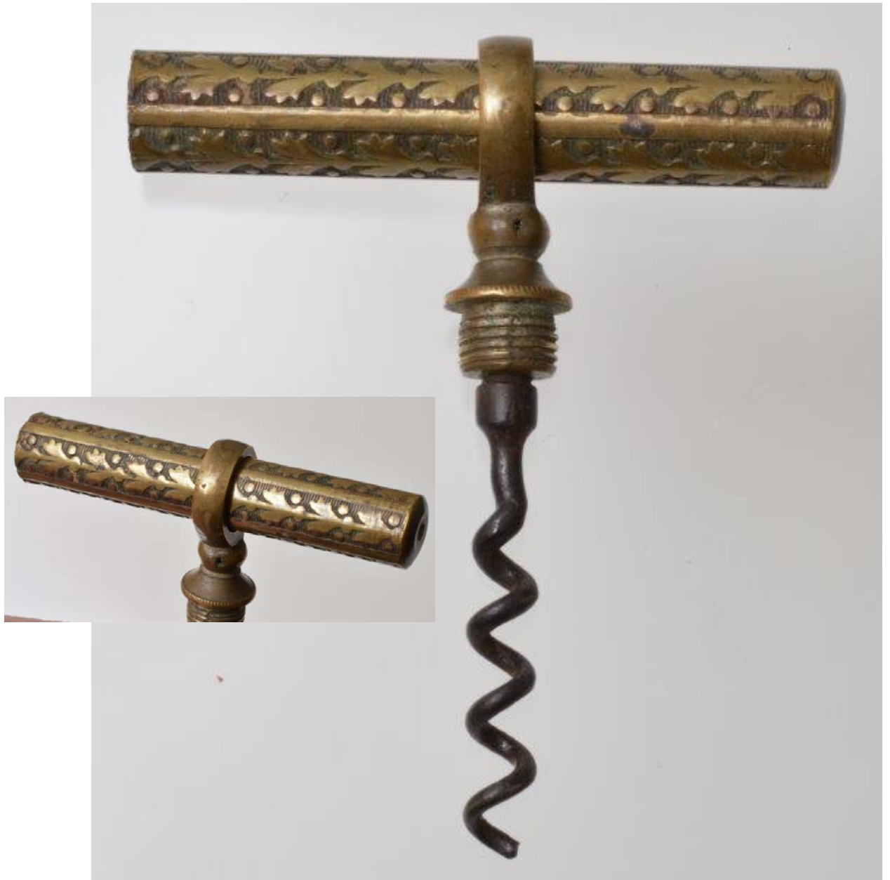
KSM081 1870s Brass decorative picnic. See Ellis page 34 for Coney design. Also see Peters – Giulian page 73. $75