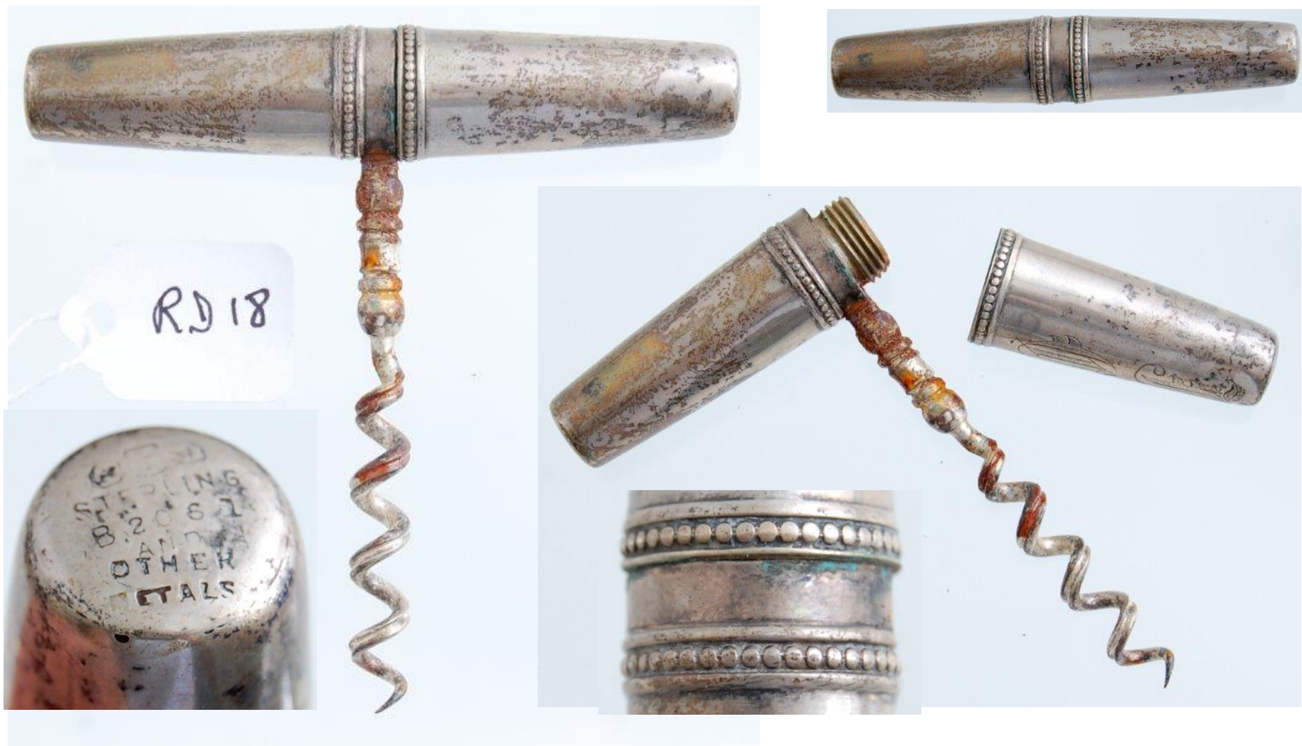
RD18 Maker's mark plus STERLING B2061 AND OTHER METALS (referring to the core, the mechanism, and the worm). $75