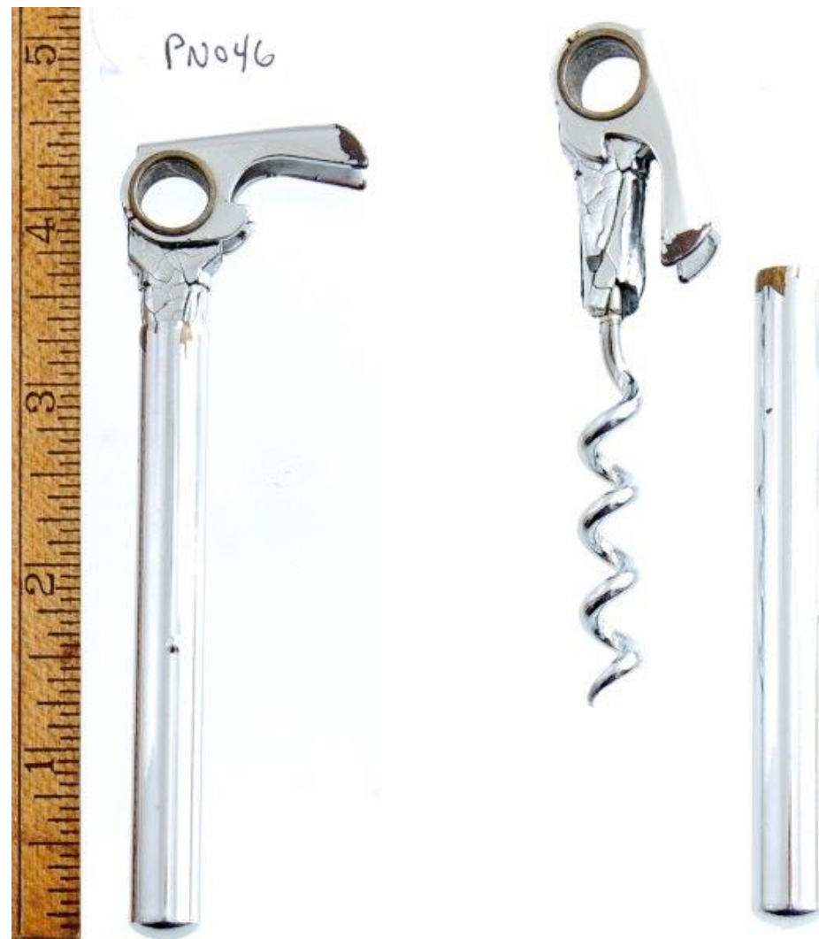
PN046 Friction fit sheath. Plating wear. $15