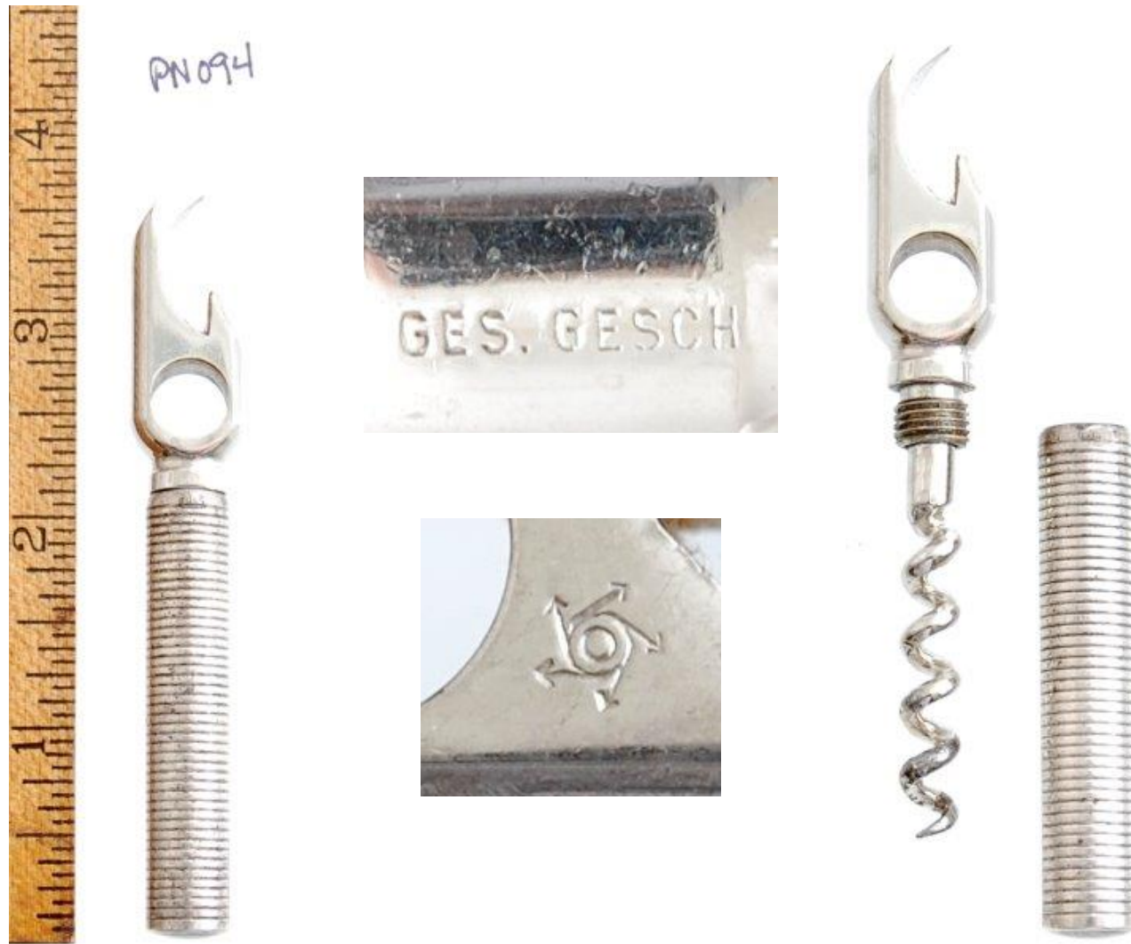
PN094 Marked GES GESCH for GESETZLICH GESCHÜTZ (protected by law). Pfeilring trademark. $29