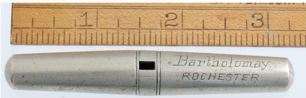
RD137 Roundlet from the Bartholomay Brewing Company, Rochester, New York. $75