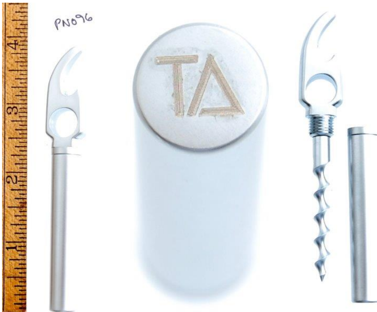
PN096 Tau Delta Greek letters on the bottom. $19