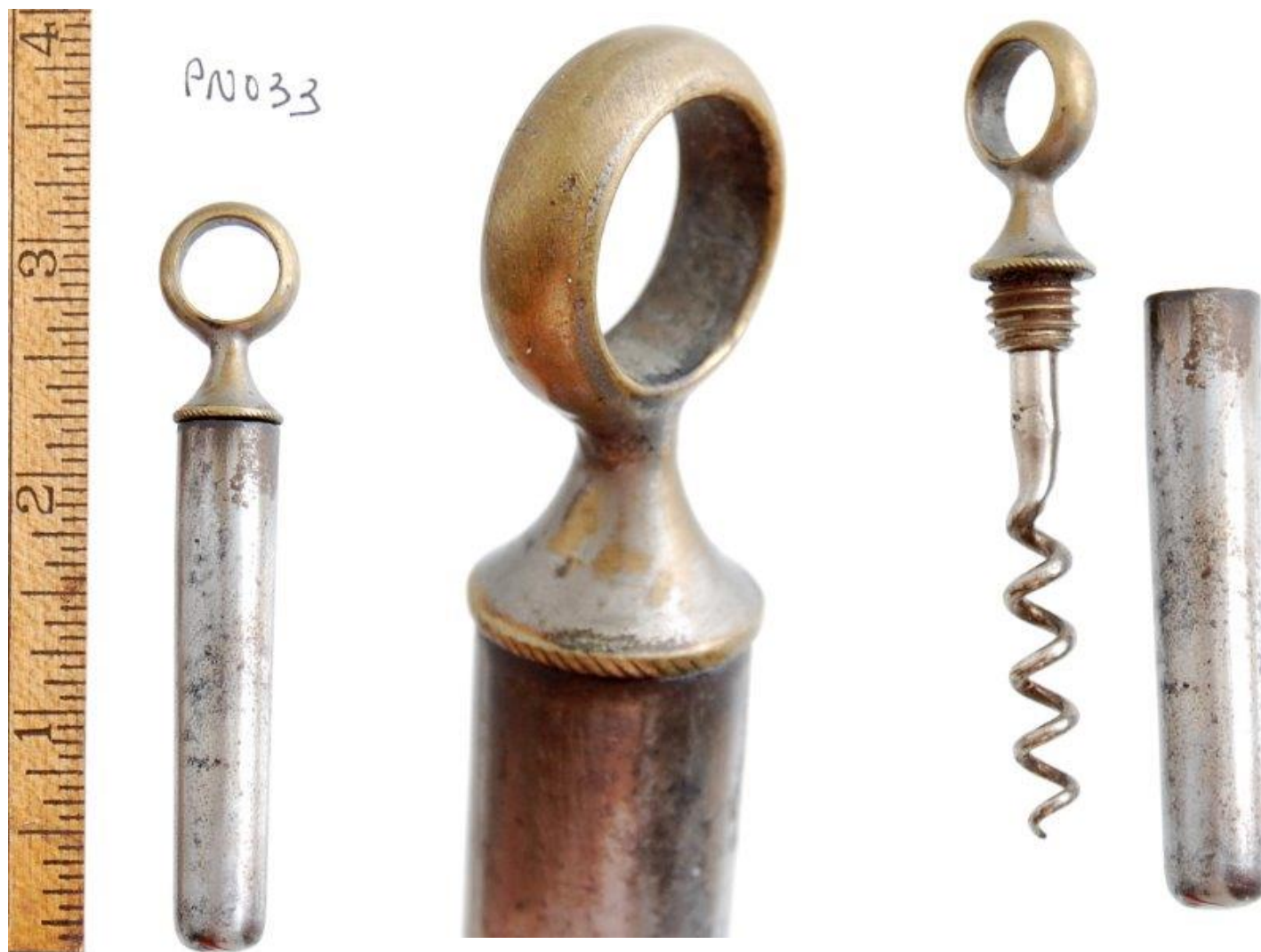
PN033 Brass top. Steel sheath. Delicate worm. $25