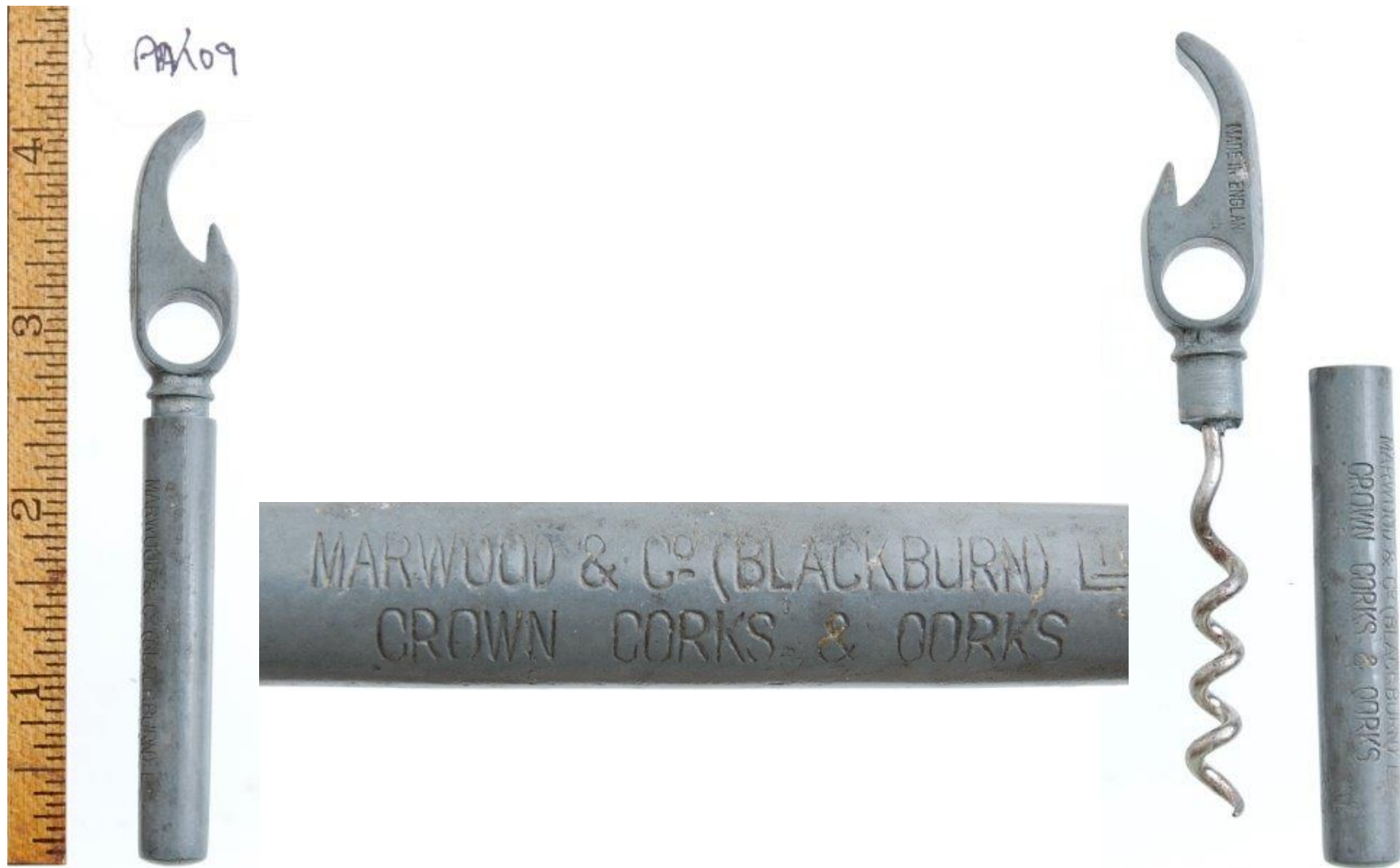
PN109 Picnic corkscrew from Marwood & Co., Crown Corks & Corks. $75