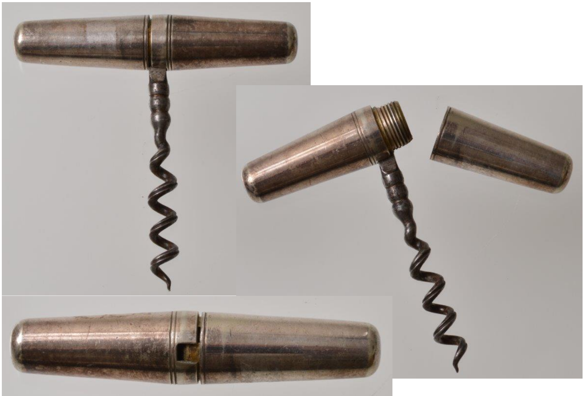
KSM146 Roundlet. $45