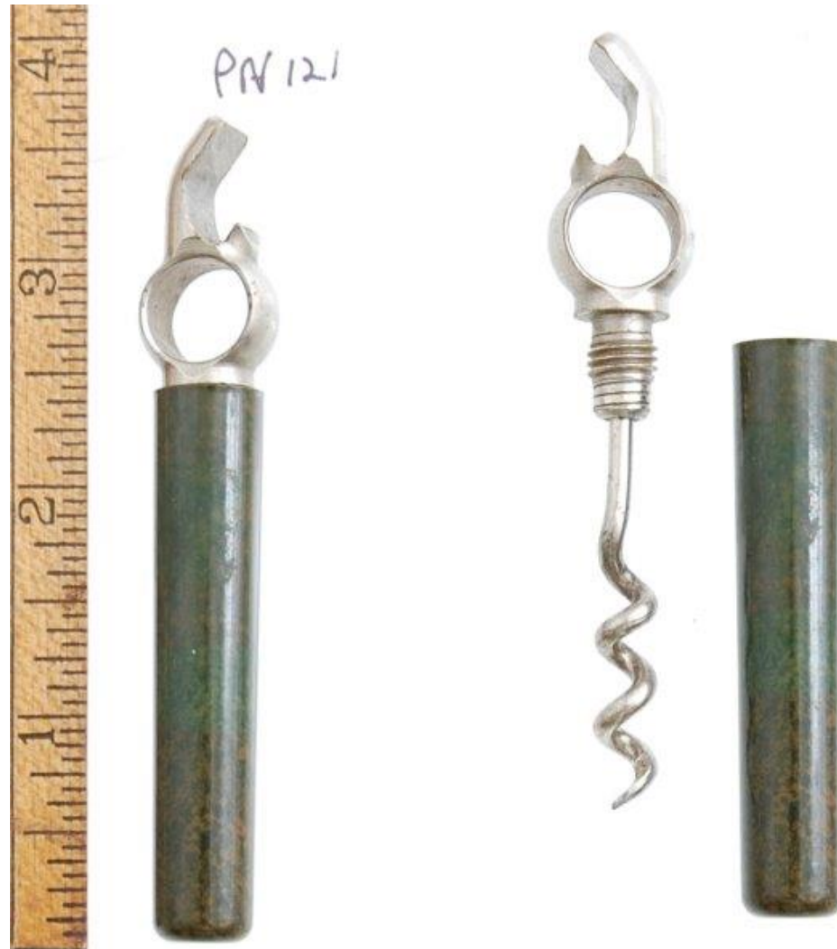
PN121 Picnic Corkscrew. Mottled olive drab sheath. $7