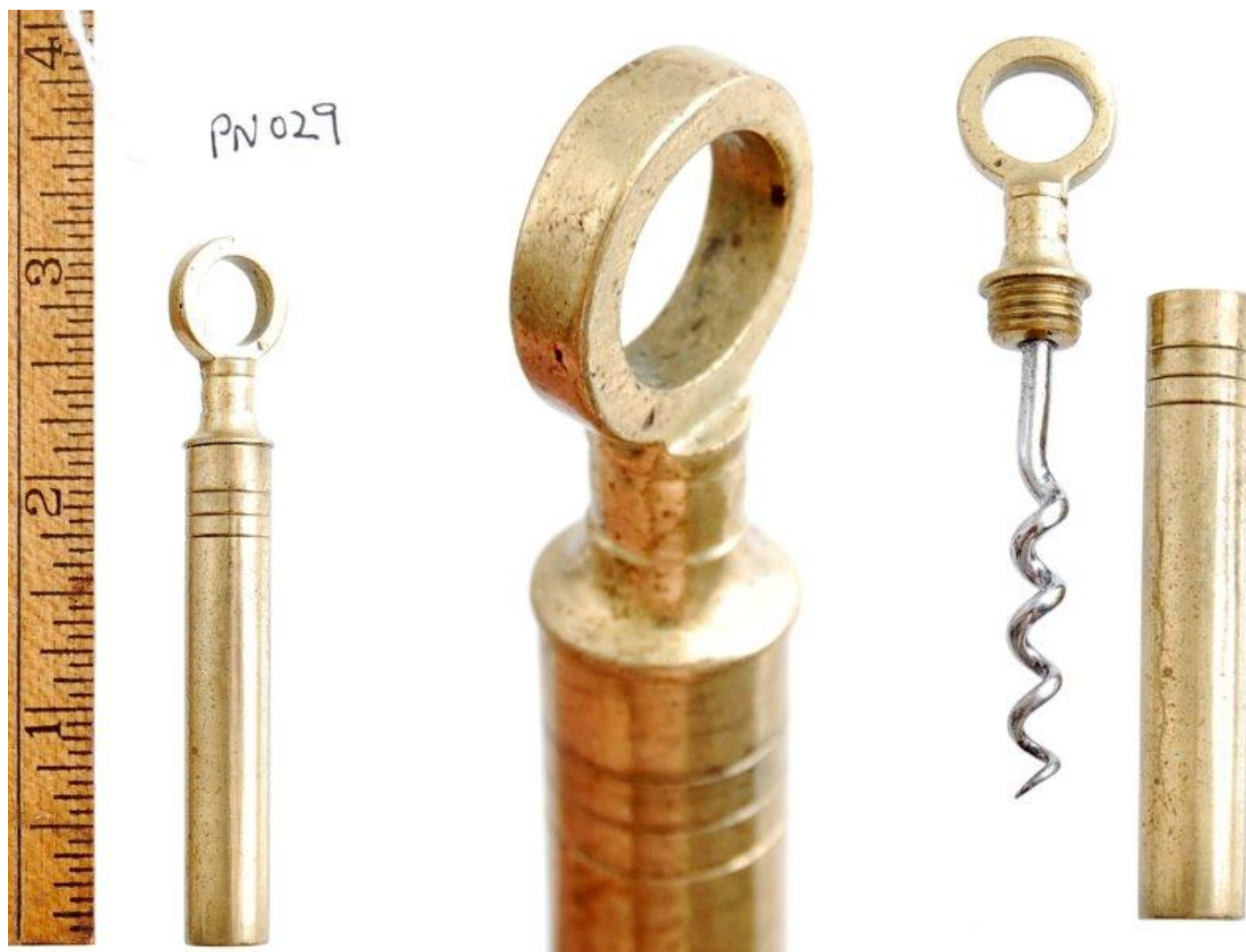
PN029 Brass corkscrew. $39