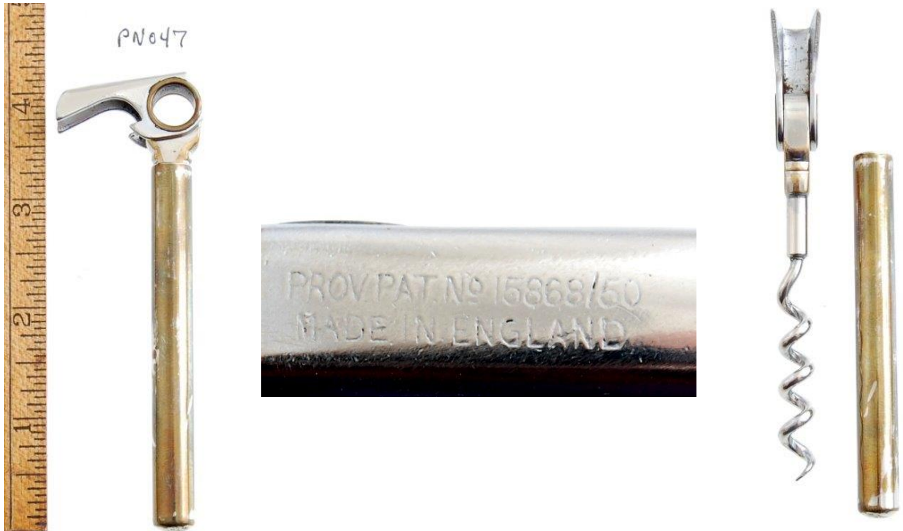
PN047 Provisional Patent Corkscrew marked as shown. $39