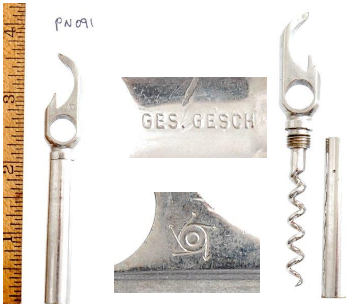
PN091 Marked GES GESCH for GESETZLICH GESCHÜTZ (protected by law). Pfeilring trademark. $16