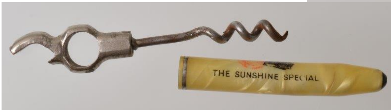
KSM149 Picnic advertising Missouri Pacific Lines. $5