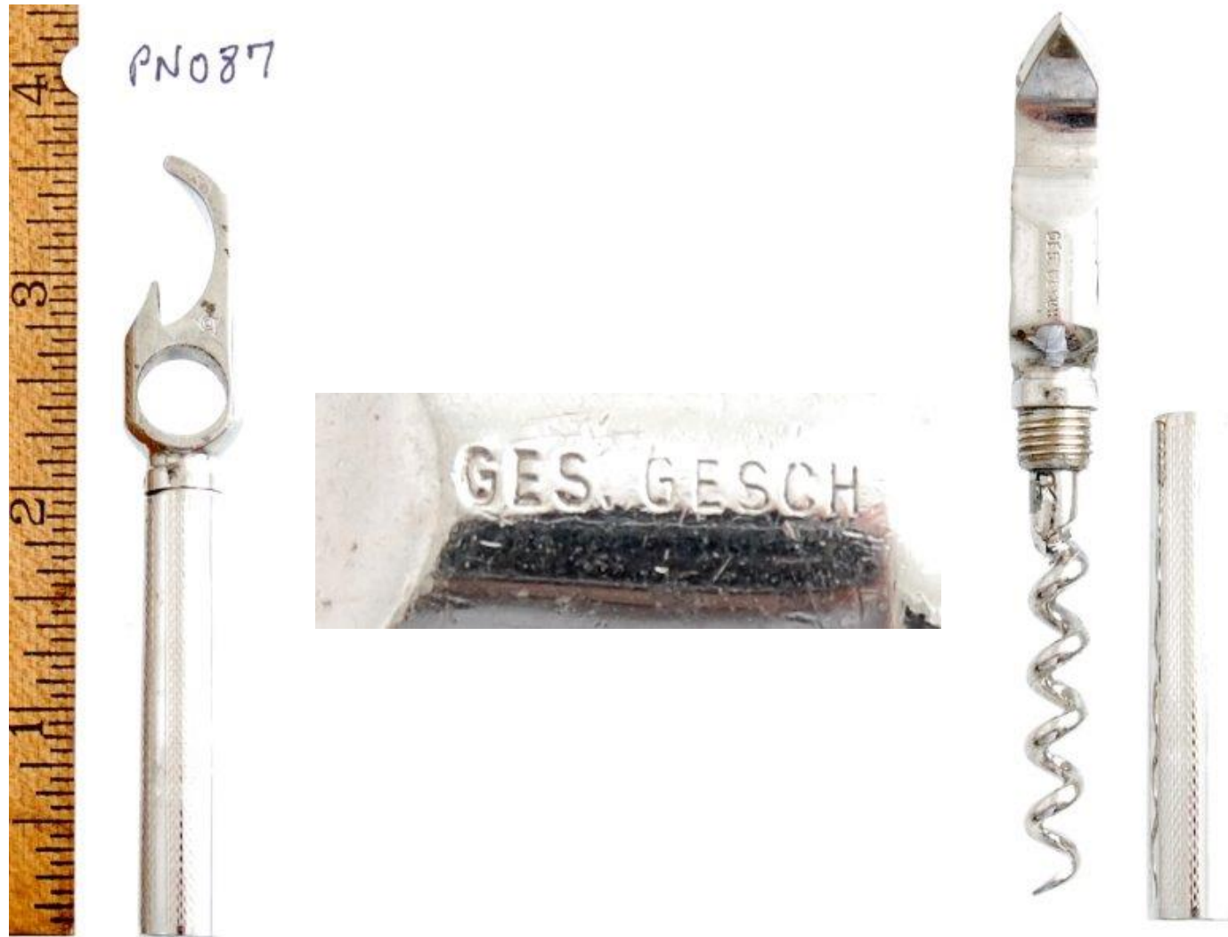
PN087 Marked GES GESCH for GESETZLICH GESCHÜTZ (protected by law). Decorative case. $29