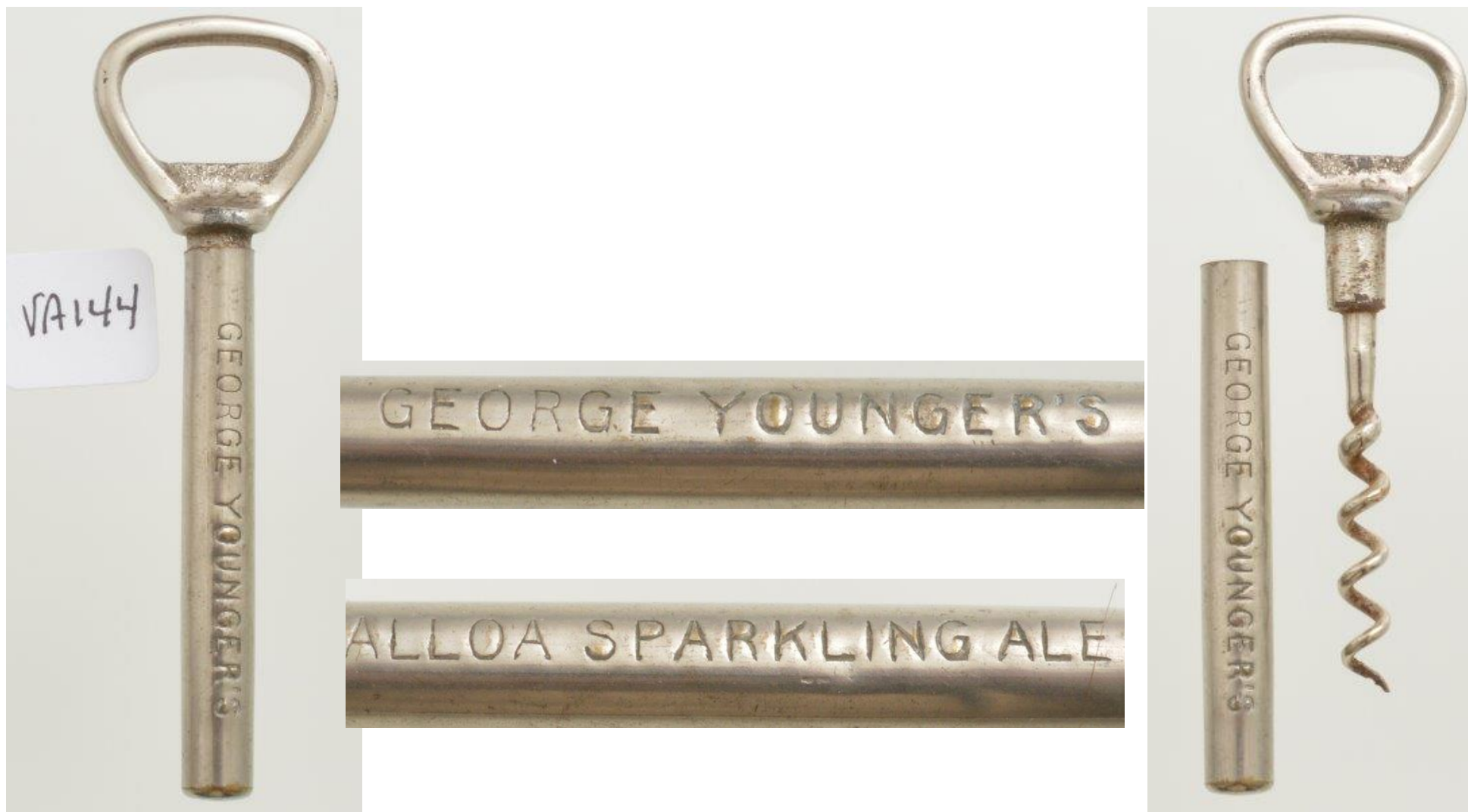
VA144 Combination corkscrew and cap lifter advertising “George Younger’s Alloa Sparkling Ale.” $29