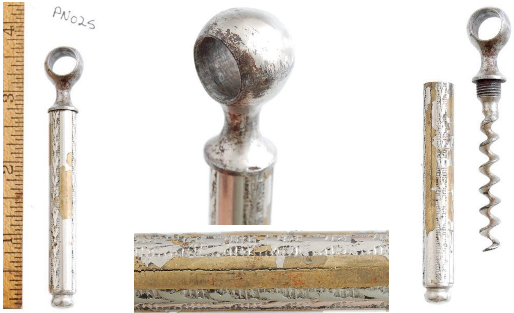
PN025 Steel worm with worn plated brass sheath.$29