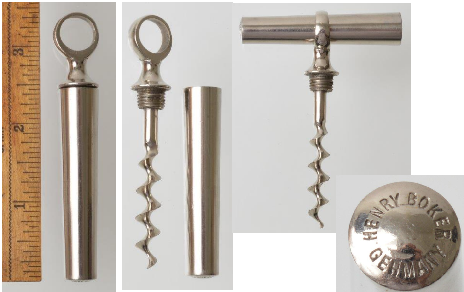
XX069 Picnic corkscrew marked HENRY BOKER GERMANY. $35