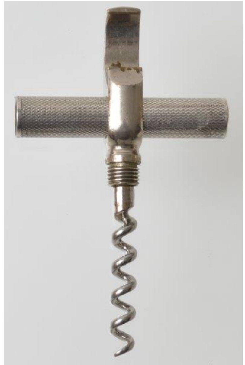
XX093 Picnic corkscrew with silver-plated sheath. $12