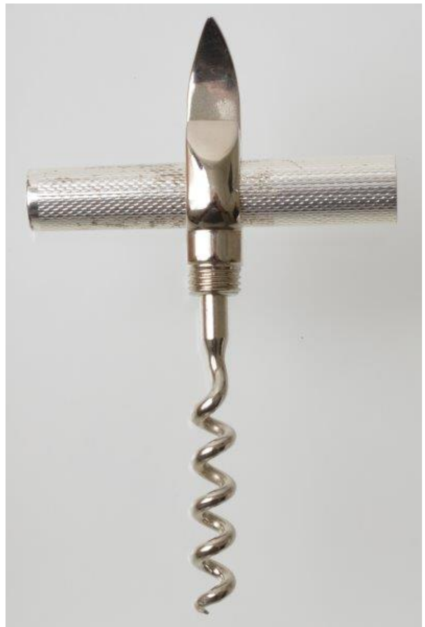
XX091 Picnic corkscrew with silver-plated sheath. $12