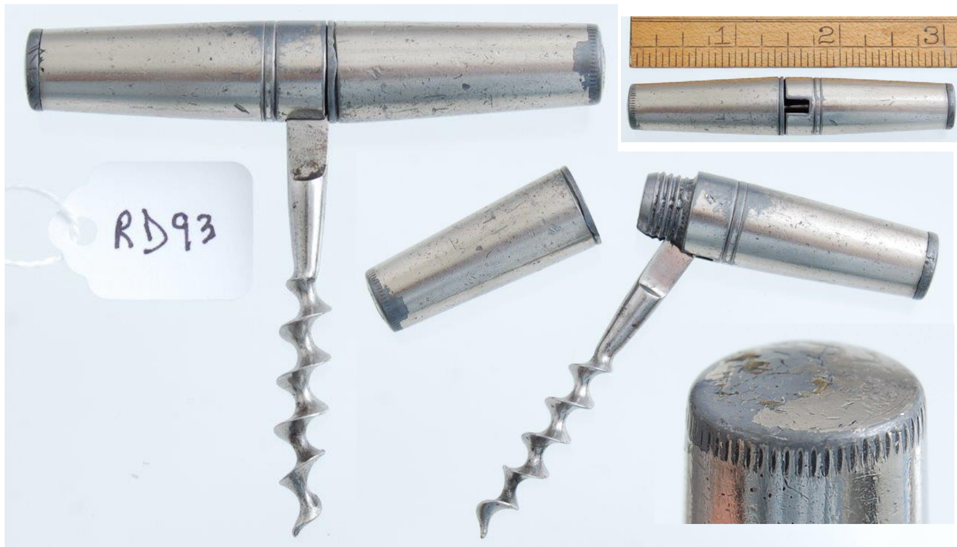
RD93 Not marked. $10