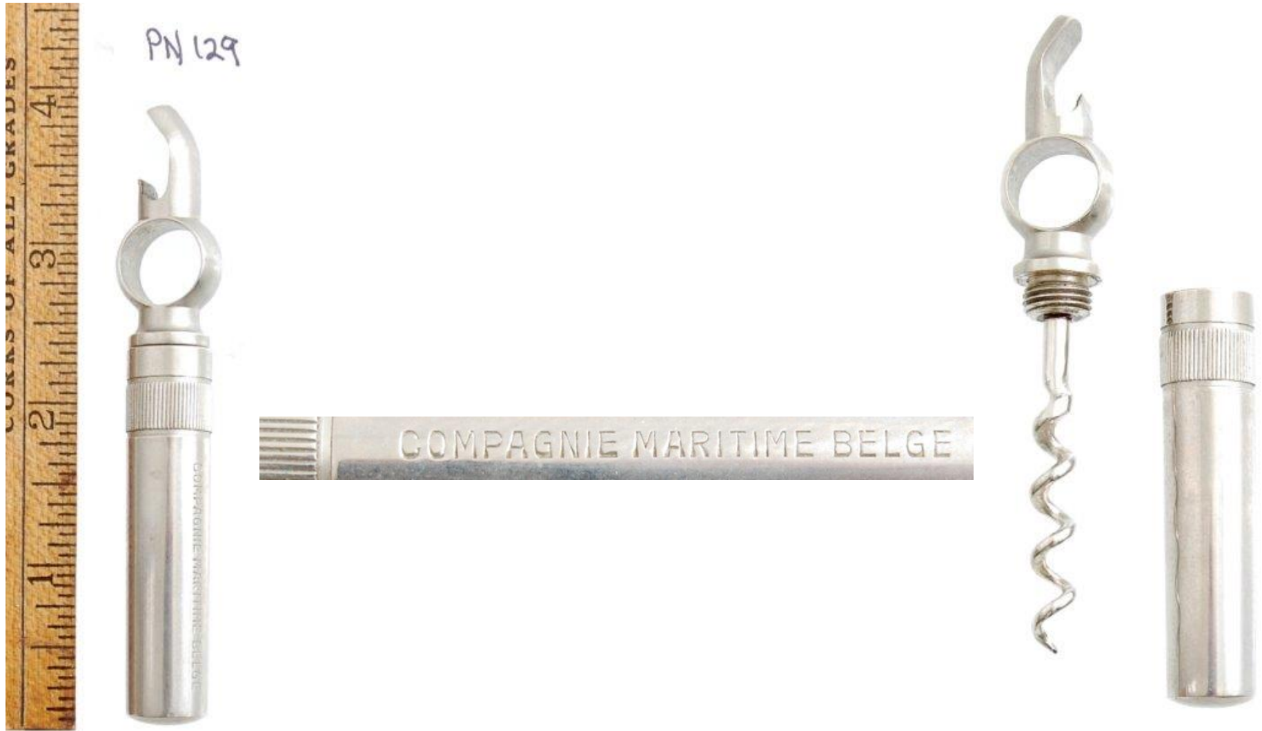
PN129 Picnic corkscrew from the Belgian company “Compagnie Maritime Belge.” $25