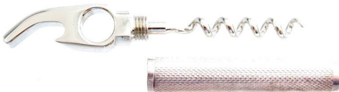
PN100 Corkscrew in jeweler's box. $39