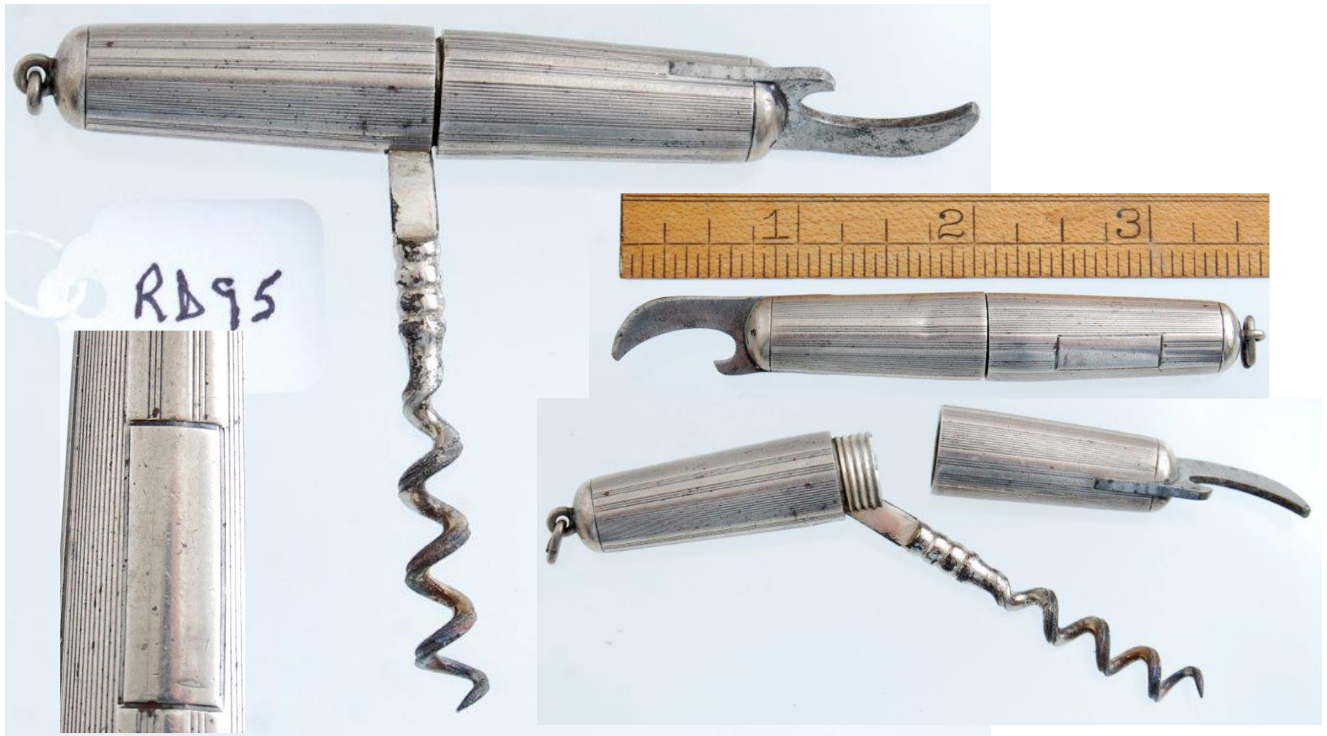
RD95 Combination corkscrew and cap lifter. Lined with space for engraving monogram/message. $75