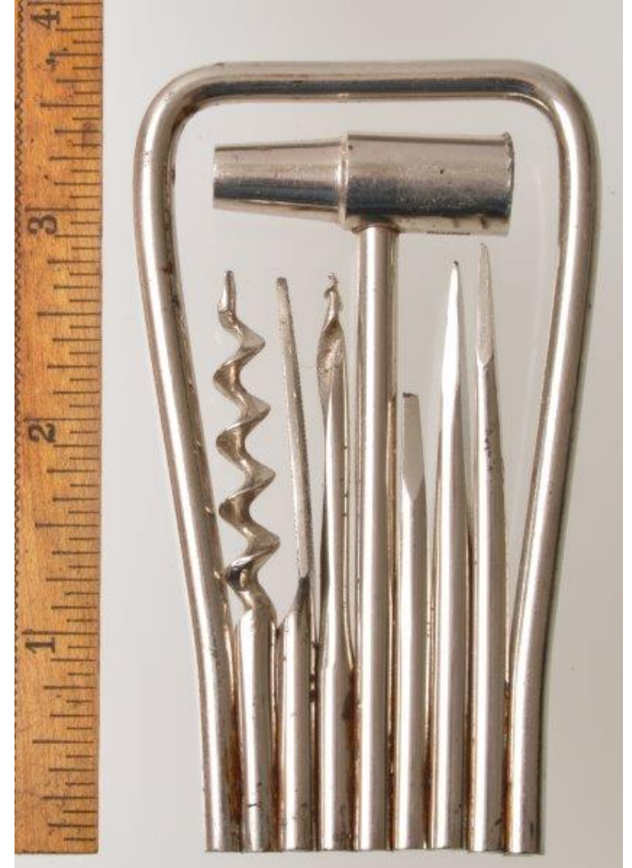
KBW070 1949 Louis Strauss Patent "Utility Tool Kit." $25