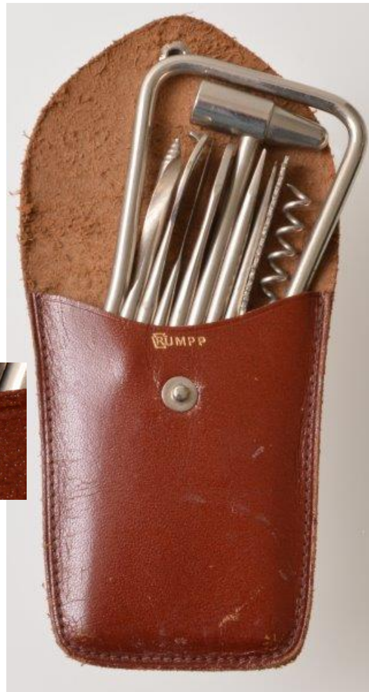
KBW067 1949 Louis Strauss Patent "Utility Tool Kit." $45