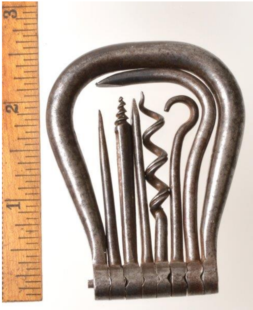
KBW024 Six tool folding bow. $125