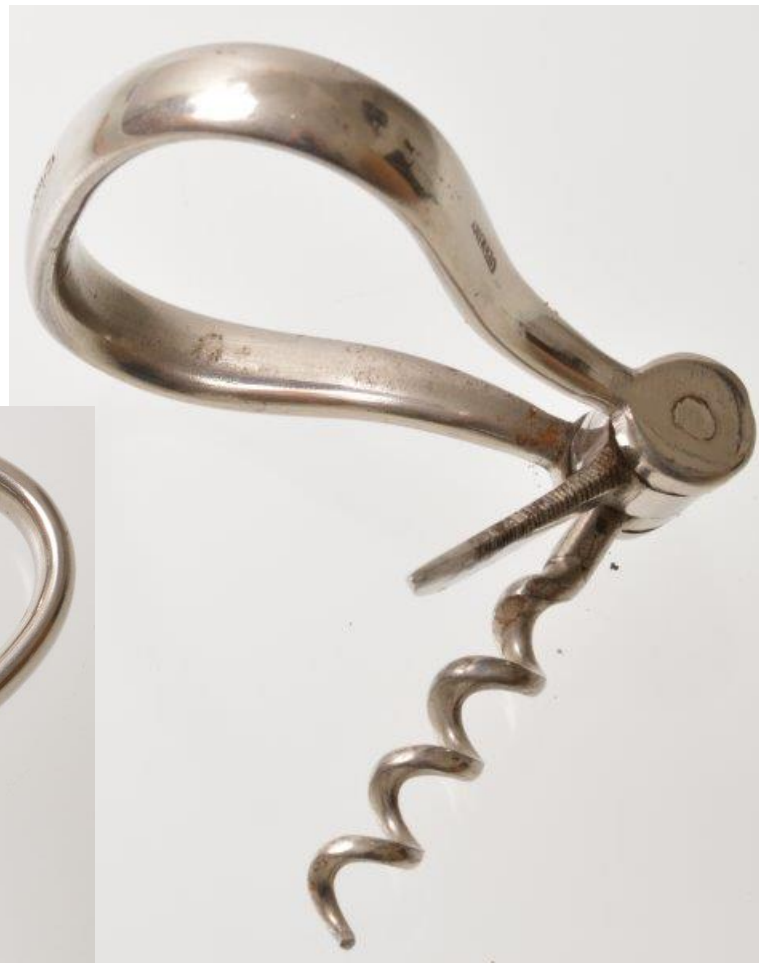
KBW040 Folding bow marked as shown. $65