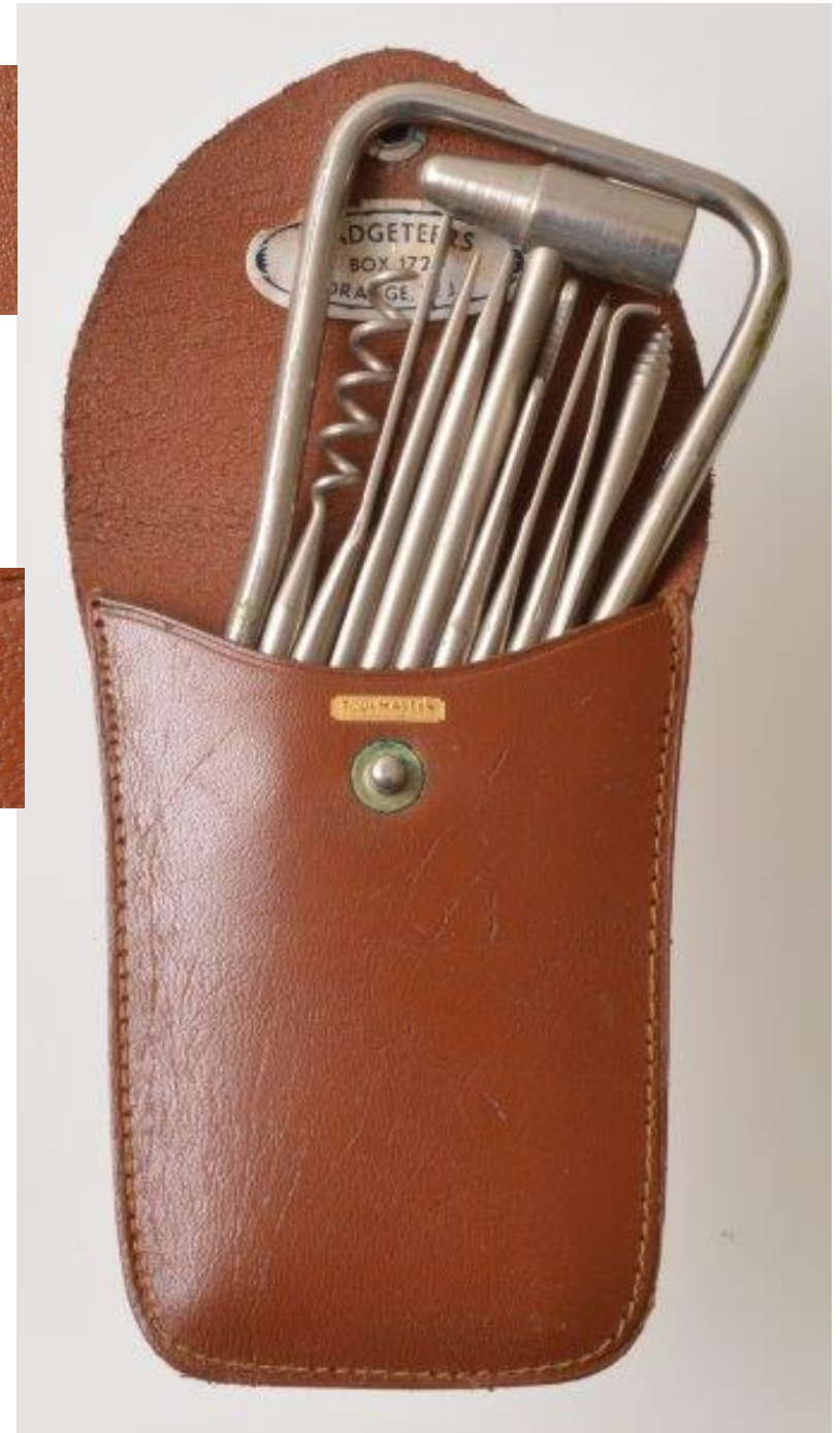
KBW066 1949 Louis Strauss Patent "Utility Tool Kit." $45