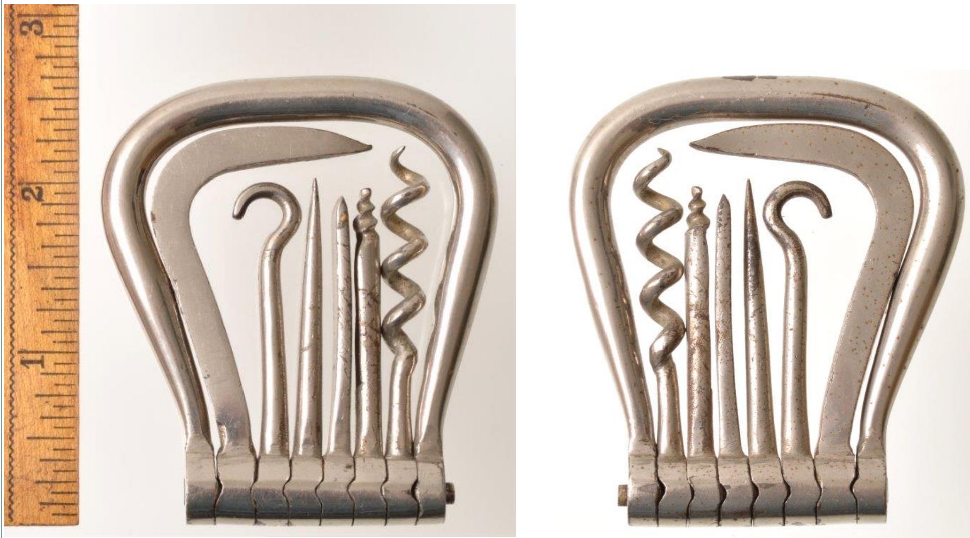
KBW041 Nice six tool folding bow. $125