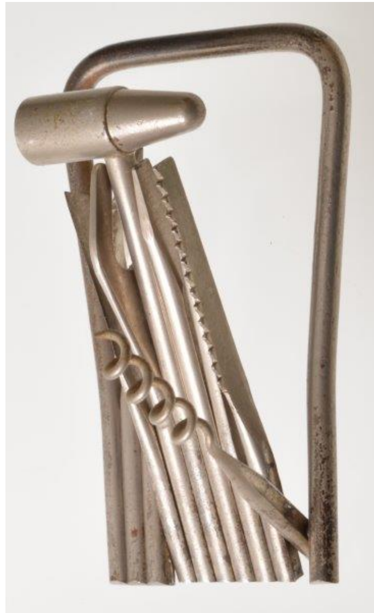
KBW071 1949 Louis Strauss Patent "Utility Tool Kit." $25