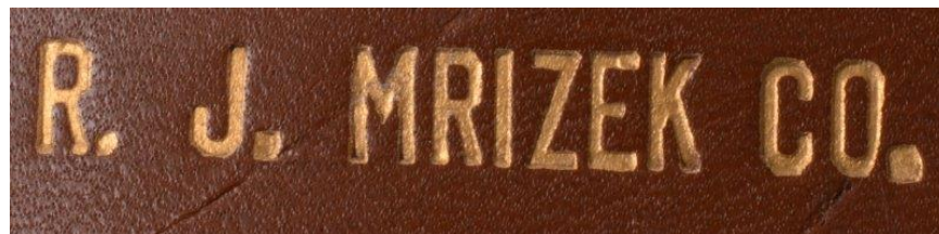
KBW068 1949 Louis Strauss Patent "Utility Tool Kit." $45